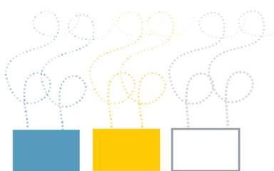
Old BG - Sweetscent with the components separated from each other.