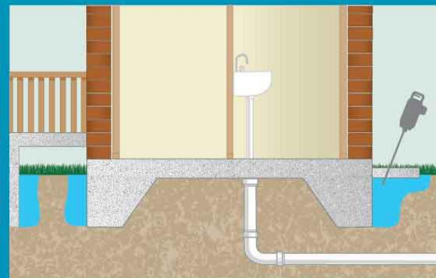
Illustration 2: Shows the application of ALTRISSET to the soil around the exterior foundation.

Faults or joints in concrete slabs should be assessed and internal drilling may be required on some home depending on the slab type.