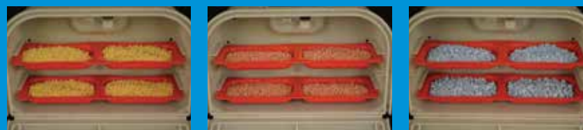
Zyrox® Fly Granular Bait 0.85 oz (24 g)

The bait matrix of Zyrox has a lower bulk density than most competitor fly baits. This allows for comparable surface area coverage and volume to other baits, but with fewer pounds of bait to carry, move and store. The recommended use rate of Zyrox is 3.2 oz/1,000 ft 2 , and the high rate of 6.4 oz/1,000 ft 2 can be used for high-level fly infestations.