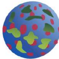
Anti-evaporant comes out of solution