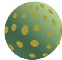
Anti-evaporant forms protective “skin” around droplet

The key result is that Aqua K-Othrine® provides longer-lasting spray cloud that is more effective in reducing adult mosquito populations in all climatic conditions. Aqua K-Othrine® is as effective as oil/diesel diluted space spray concentrates but without the oil and the cost.